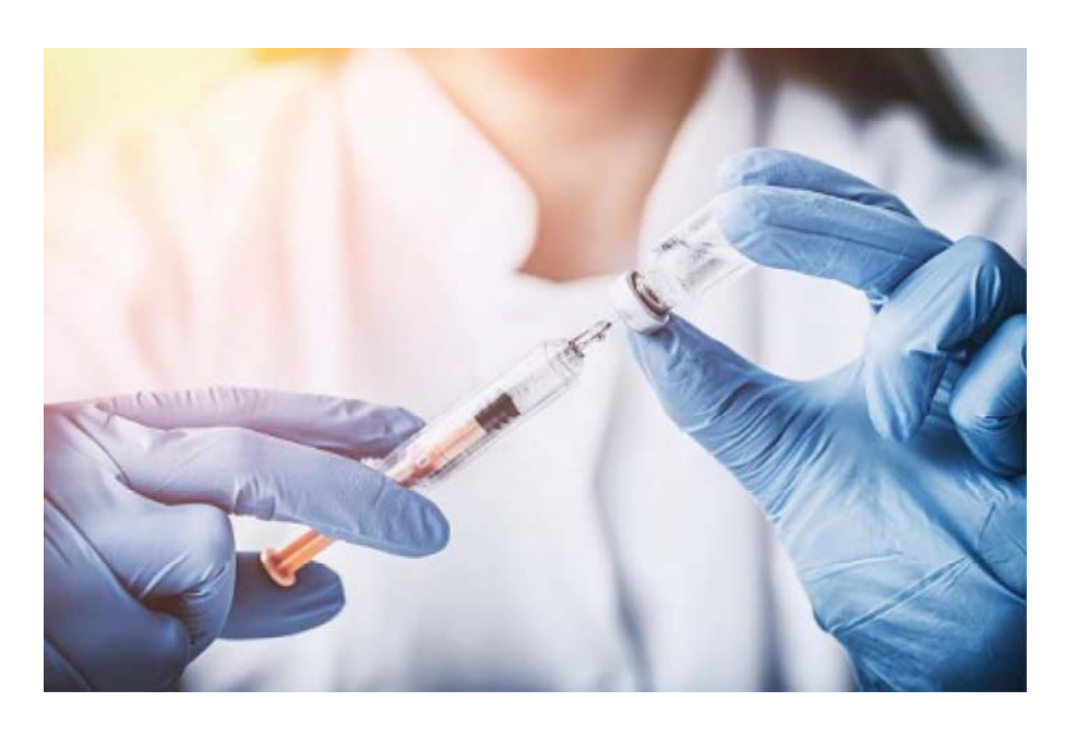
CLINICAL TRIAL EHVA clinical trial authorization granted in Switzerland and the UK for a novel therapeutic vaccine candidate

Swiss and UK medical authorities have granted the European HIV Vaccine Alliance (EHVA) the permission to start a phase I/II clinical trial (EHVA T01/ANRS VRI05). The trial will evaluate the safety and immunogenicity of a therapeutic prime-boost vaccine regimen in combination with a monoclonal antibody. The trial is scheduled to run in six European countries, sponsored by INSERM-ANRS (French National Institute of Health and Medical Research) and is expected to start in September this year.